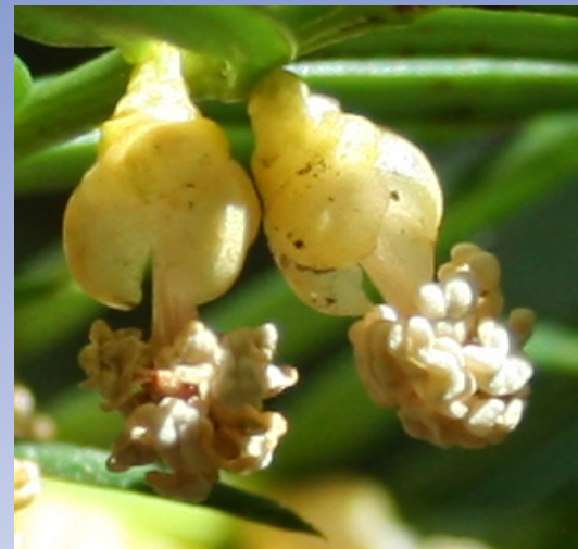
◀ male pollen cones

▶ scales fuse in mature aril, holding single seed